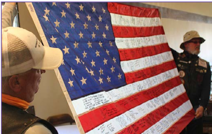
The Gold Star American Flag

"So long as there are veterans, the Benevolent and Protective Order of Elks will never forget them."